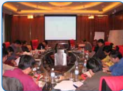
to theoretical exercises ...