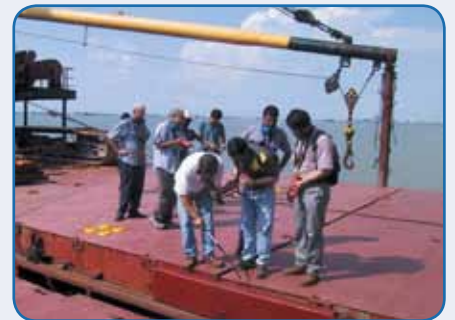
and on board training.