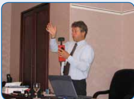
From the classroom ...

More information about the trainings can be found on the SDT website on www.sdt.eu .